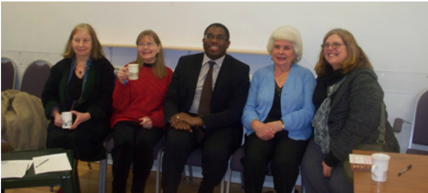
David Lammy MP (Tottenham) on a recent visit to Haringey Carers Centre – meeting with carers, staff and Trustee.